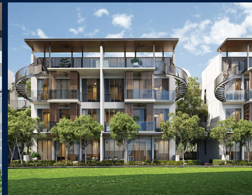
Sereen : 3 - Bedroom